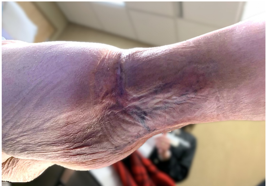
FIGURE 4: At the nine-month follow-up office visit, fully re-epithelialized and healed.

NPWTi-d = negative pressure wound therapy with instillation and drainage