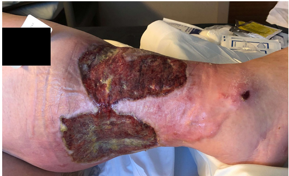
FIGURE 2: Chronic PG ulcer of three years on right posterolateral lower extremity prior to adjunct NPWTi-d therapy in addition to systemic immunosuppression therapy (day 0). Size is 19.7 x 10.6 cm.

NPWTi-d = negative pressure wound therapy with instillation and drainage