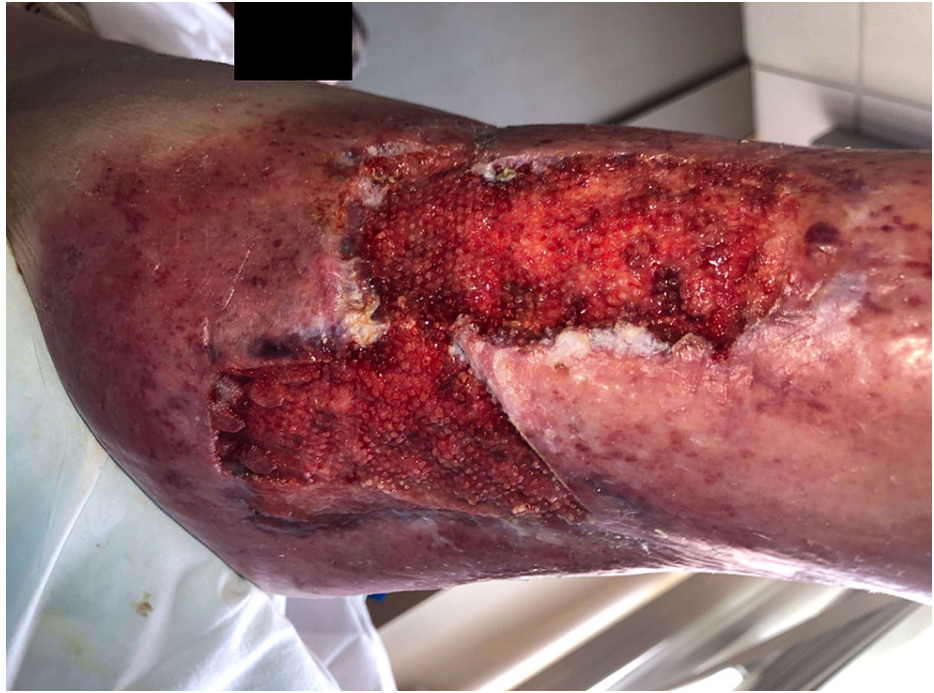
FIGURE 3: After 56 days of consecutive NPWTi-d therapy (115 days since the start of NPWTi-d). Size is 12.3 x 11.1 x 0.6 cm.

NPWTi-d = negative pressure wound therapy with instillation and drainage